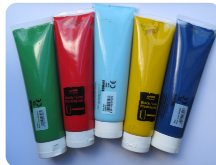
coloured printing inks