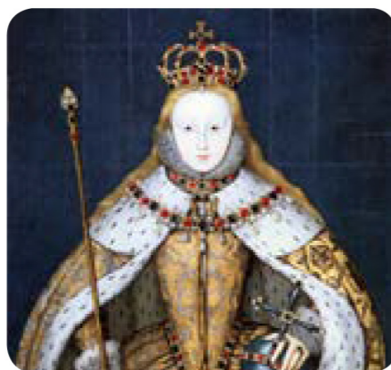
Coronation Portrait by unknown artist, c1600