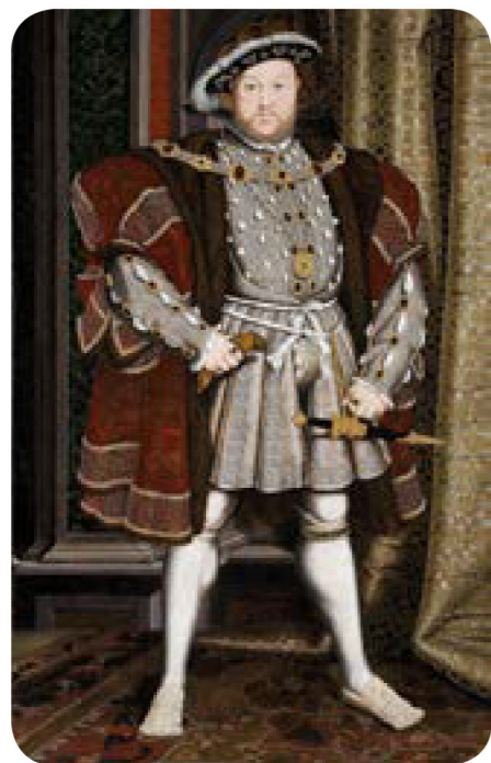
Henry VIII by Hans Holbein the Younger, 1537–47