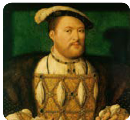
Portrait of Henry VIII by Joos van Cleve, c1530–1535

A portrait is a painting or photograph of a person. It usually shows their head and shoulders, but may show their whole body. Before cameras were invented, kings and queens often had official portraits painted to show how powerful and important they were.