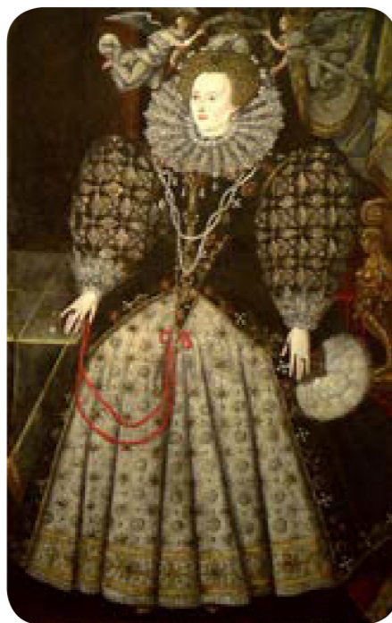
Portrait of Elizabeth I of England attributed to Nicholas Hilliard, 1590