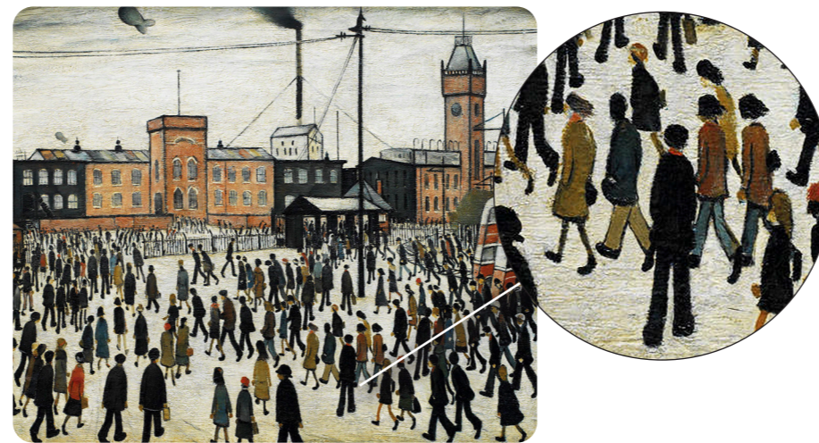
Going to Work by LS Lowry, 1959