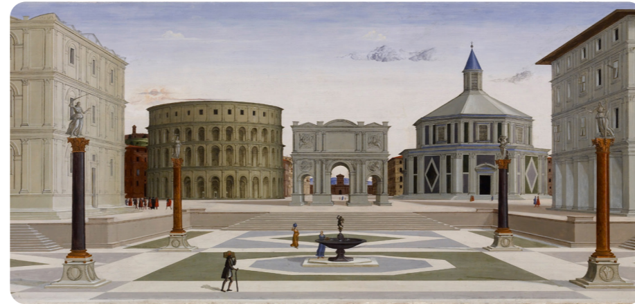
The Ideal City by Fra Carnevale, c1480–1484

Urban landscapes are drawings of towns and cities shaped by the people and buildings found there. Different atmospheres are created using bright, dark or muted colours and sharp or blurry lines.