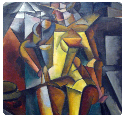
The Model by Lyubov Popova, 1913