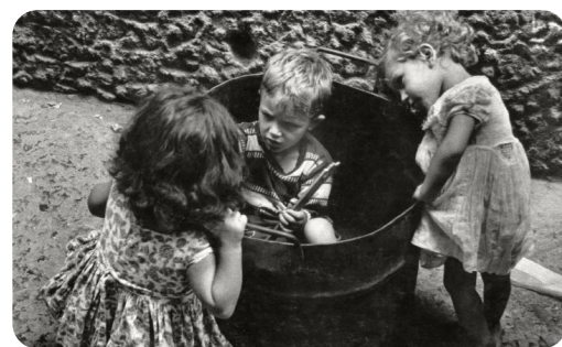
Naples, Italy – Children by Herbert List, 1961

Figurative forms portray their subjects, which are generally posed, as accurately as possible.