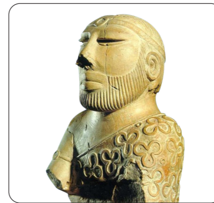
Indus Valley statuette