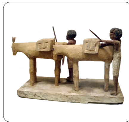
Ancient Egyptian figurines

The making of statues, statuettes and figurines is an ancient craft. It was an important part of the culture of past civilisations, including ancient Sumer, ancient Egypt and the Indus Valley. The sculptures made by these civilisations include important people, such as monarchs and religious deities. They also tell us about the everyday lives of the people who were part of these ancient civilisations and the things that were important to them.