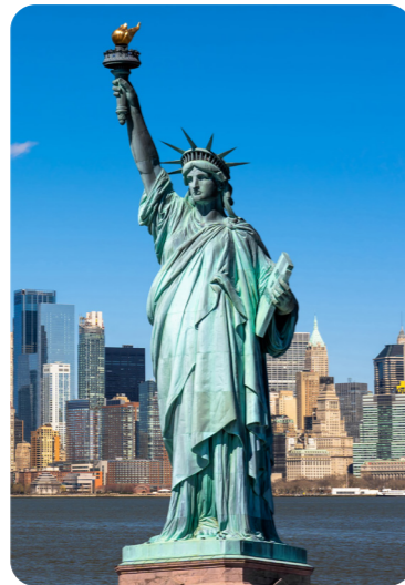
Statue of Liberty (Liberty Enlightening the World)

A statue is a three-dimensional representation of a person, animal or mythical being. It is usually the same size as the person or animal in real life or much larger. Most statues are displayed outdoors, so artists make them from durable materials, including stone or metal, such as marble or bronze.