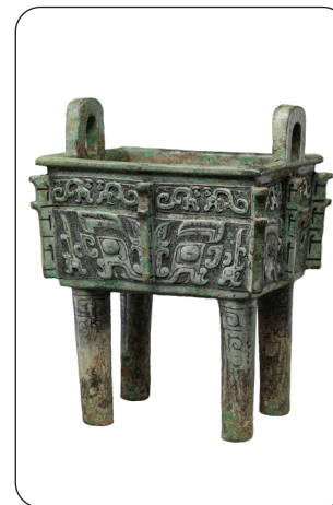
Bronze ritual vessel, c1600–c1046 BC