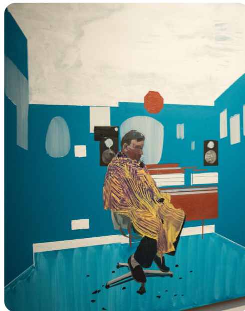
Peter's Sitters 3

Peter's Sitters 3 (2009) by Hurvin Anderson connects his Caribbean heritage with life in England. Colour symbolises his Caribbean heritage, while the barbershop symbolises an important aspect of life in England to Afro-Caribbean immigrants.