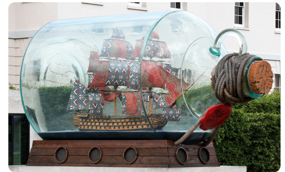
Nelson's Ship in a Bottle

Nelson's Ship in a Bottle (2010) by Yinka Shonibare was the first commission for Trafalgar Square by a black artist. It symbolises and celebrates the story of multiculturalism in London.