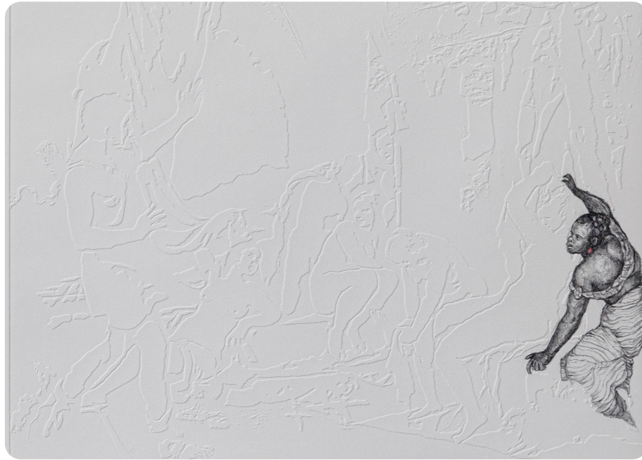
Vanishing Point 7