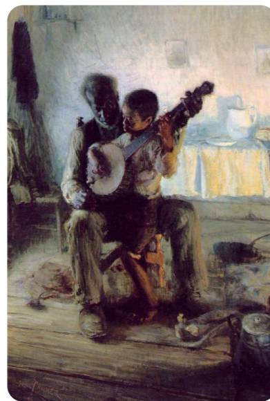
The Banjo Lesson

The Banjo Lesson (1893) by Henry Ossawa Tanner shows an elderly man teaching a young child the banjo, symbolising the resilience, intellect and caring nature of the once enslaved African American people.