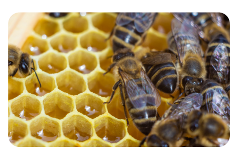
honey from bees