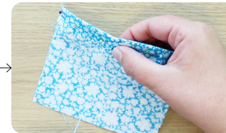
Use a needle and thread to sew running stitches along the hem.