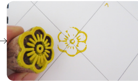
Press the block onto a piece of paper or fabric.