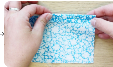
Turn the edge of the fabric over to make a 1.5cm hem. Pin it in place.