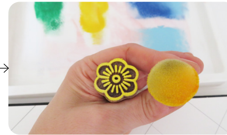
Cover the printing block with ink using a sponge or brush.