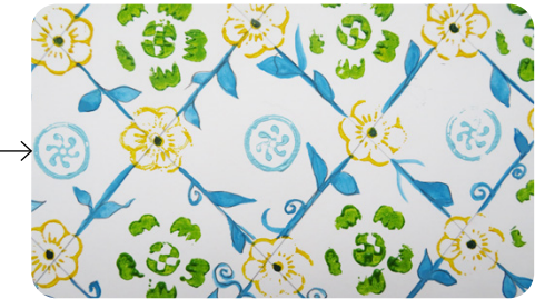
Repeat with other blocks and colours until the pattern is complete.