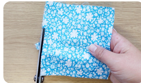
Trim the edge of the fabric with pinking shears.

A hem runs along the edge of a piece of cloth or clothing. It is made by turning under a raw edge and then sewing to give a neat finish to the fabric and to stop it from fraying.