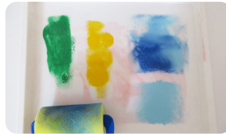
Use a roller to spread ink onto a printing tray.

Block printing uses a block with a pattern or motif carved into its surface. Ink or dye is applied to the carved surface, which is pressed onto fabric or paper repeatedly to make a pattern.