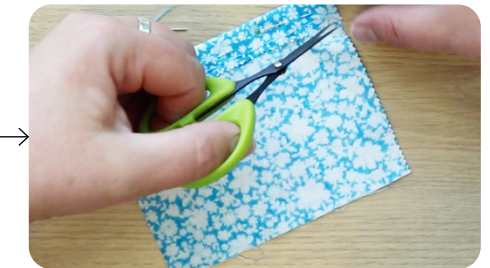
Tie a knot at the end of the hem and cut the thread. Iron along the crease to flatten the hem.