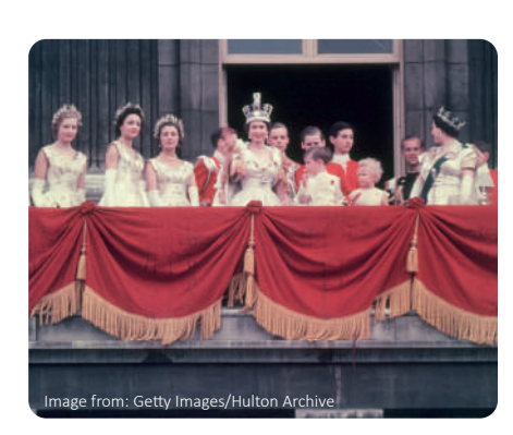
Queen Elizabeth II on her coronation.

A coronation is a ceremony where the crown is placed on the head of the new king or queen. Elizabeth II was the Queen of the United Kingdom for 70 years until she died in 2022. The coronation ceremony of Elizabeth II took place on 2nd June 1953 at Westminster Abbey, London. Many people celebrated the coronation by holding street parties.