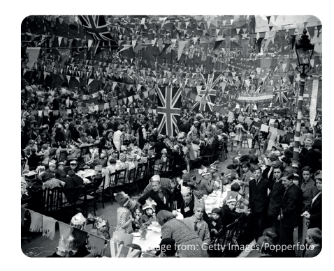
Street party to celebrate the coronation.