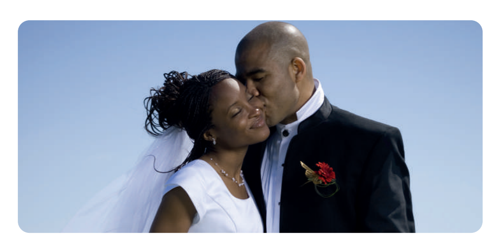
Weddings happen when two adults get married.