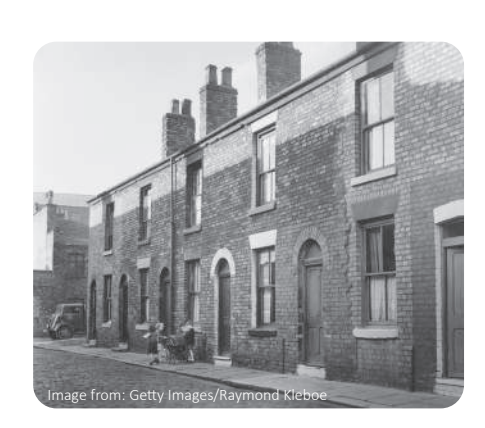
A street in the 1950s.

The way people use land changes over time. For example, in the 1950s there were fewer cars, so fewer roads were needed. Today lots of people have cars, so there are many more roads for people to drive on and driveways for parking.