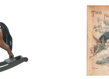
wooden rocking horse