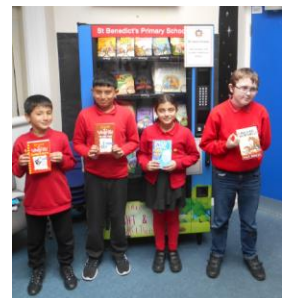
Recent winners from KS2